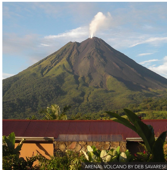
ARENAL VOLCANO

Early this morning go birding on the lodge's trails. After breakfast, transfer to Arenal Hanging Bridges for birding along the 15 bridges, six of which are suspended in the upper canopy of this mature forest trail system (elevation is approximately 1,900 feet). The trail system straddles different types of ecosystems, forming a transitional vegetation-strip of high biodiversity where both highland and lowland species reside. There is an excellent chance to see motmots and jacamars. Return to the lodge for lunch and this afternoon continue birding on the lodge's trails. Overnight at Arenal Observatory Lodge. (BLD)