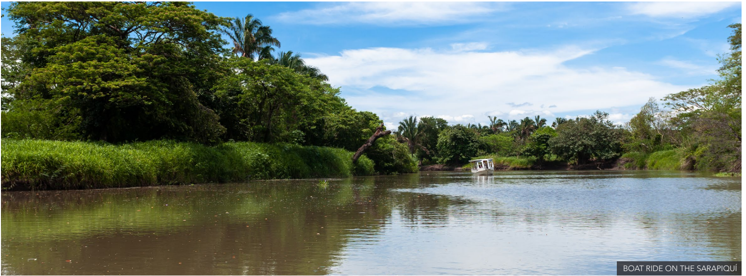
BOAT RIDE ON THE SARAPIQUÍ