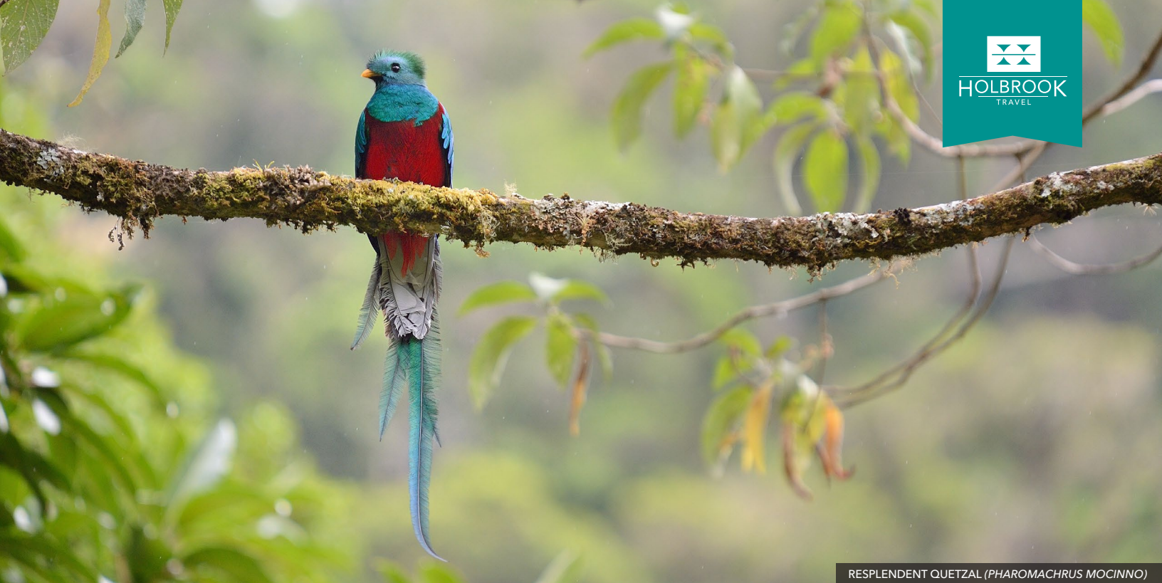
RESPLENDENT QUETZAL (PHAROMACHRUS MOCINNO)