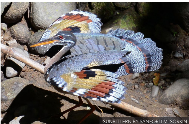
SUNBITTERN BY SANFORD M. SORKIN

This morning meet for breakfast and orientation in the hotel restaurant. After breakfast, receive an introductory presentation on tropical birding from a local expert. Check out of the hotel and start your journey to Selva Verde Lodge & Rainforest Reserve. En route, stop for birding at Cinchona and Virgen del Socorro, if road conditions permit. Selva Verde Lodge is situated in the Caribbean lowlands, at elevations ranging from 180 to 220 feet. Founded by the Holbrook family in 1985, the lodge is renowned for its commitment to ecological preservation and sustainability. The reserve is home to a large assortment of avian life, including several types of herons, egrets, hawks, falcons, macaws, hummingbirds, flycatchers, warblers, sparrows and tanagers. Specific species often spotted at Selva Verde include